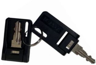
PL Laminate Standard Key Set