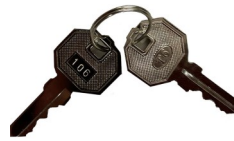
Metal Storage Standard Key Set