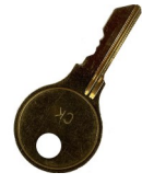
Metal Storage Core Change Key