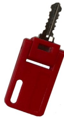
PL Laminate Core Removal