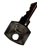
Metal Storage Master Key