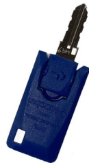
PL Laminate Master