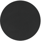
Black Vinyl Antimicrobial