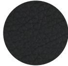
Black CULP Dillon Silver Ion Antimicrobial