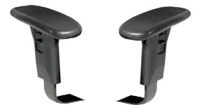
Optional Adjustable Arm Kit SKU: 311AK