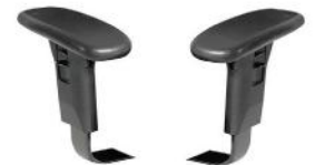
311AK – Optional, Height + Width Adjustable Arm Kit